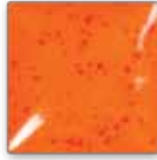
IN1208 Neon Orange Sprinkles