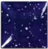
IN1212 Cobalt Blue Sprinkles