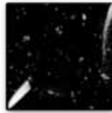
IN1216 Very Black Sprinkles