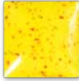
IN1209 Neon Yellow Sprinkles